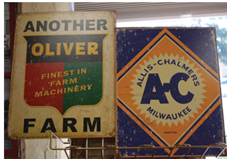
Reproduction Signs $12