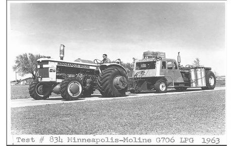
Test # 834 Minneapolis-Moline G706 LPG 1963

We also have a Twitter accounts for the Museum: @LTTMuseum, and we are on Instagram: @larsentractortest In 2018, look for more outreach through social networking. You can also review us on Yelp, Trip Advisor, and Google, so others know about this awesome visitor attraction.