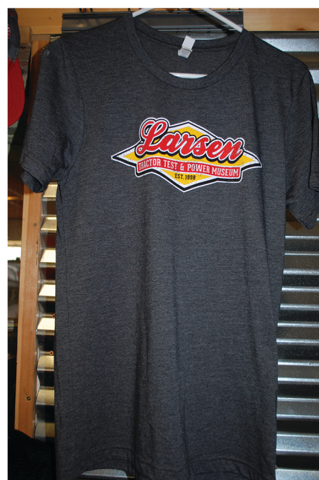
Hats and T-shirts $15