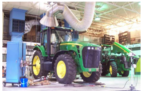
Just a short walk from the museum, the current tractor testing facility tests modern tractors before they can legally be sold in the state of Nebraska.