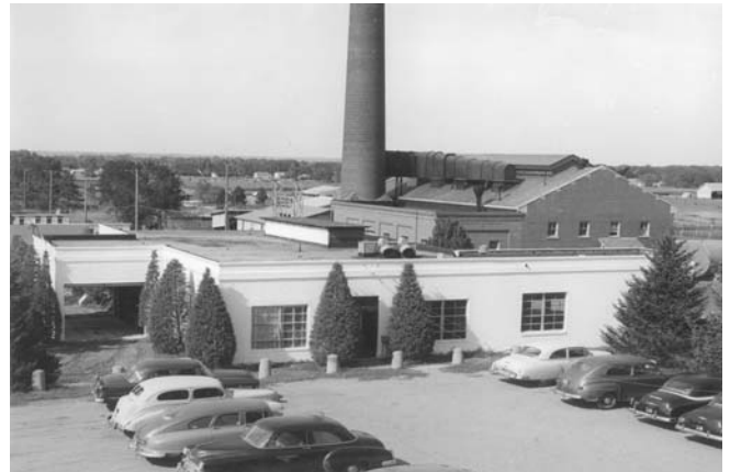
Above is an image of our current museum building during the 1940's. This was the world's first tractor test laboratory and was used for testing until 1980.

The museum is open Monday through Friday 8:30 to 4:30. Please call ahead for weekend hours. Visit the Tractor Test Museum and discover why the world recognizes Nebraska for testing the performance of tractors.