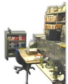
The museum library houses a collection of nearly 2,000 files.