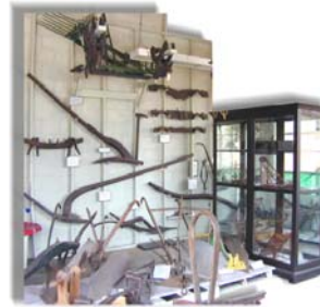
Historic plows and haying tools found on display in a new exhibit room .