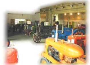
A collection of nearly 40 tractors are displayed inside the museum.